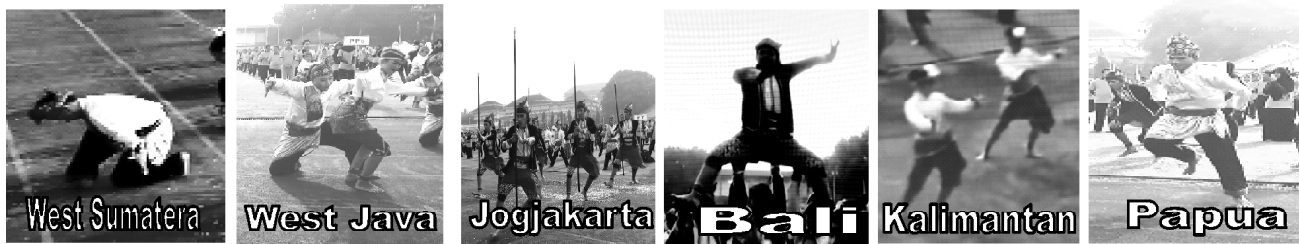
Picture: typical dance and martial arts illustrations

Contribute to sports science in Pencak silat Nusantara dance body fitness levels will have a positive effect on appearance. To achieve good body fitness needs to be done regular, directed and programmed exercises. Body fitness can be defined as a person's ability to perform physical activity in a long time without experiencing significant fatigue. These physical activities include running, walking, working, including dancing and more. Dancing requires good physical support. Physical abilities include strength, endurance, balance, flexibility and others. For the preparation of PSN dance so as not to cause injury and the emergence of health problems, then in the preparation also pay attention to supporting science such as anatomy, physiology, kinesiology and mechanics, physical condition and fitness body. [9] developmental dance movement can provide opportunity for physical, cognitive advancement for young children. Investigating learning through developmental dance movement as a kinesthetic tool in the early years foundation stage. This is in line with that expressed by [10] that the results of his study reveal the impact of bringing rest and imagery into her dance classroom (techniques drawn from somatic practice), the teaching fellow learns how to teach anatomical awareness to her high school students and to help them apply anatomy concepts to their ballet technique.